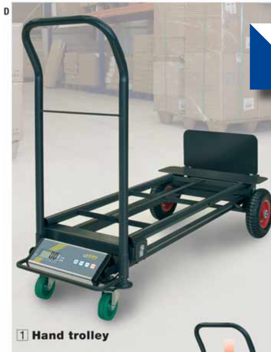
1 Hand trolley