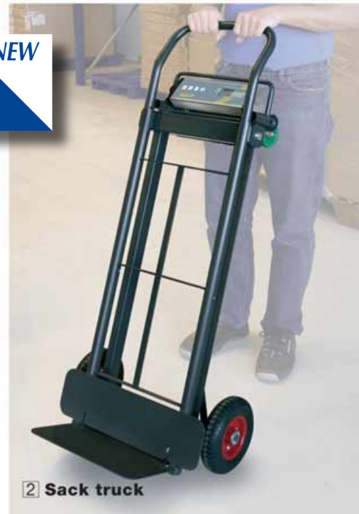
2 Sack truck

Display device can be turned. Easy to use with 4 keys only